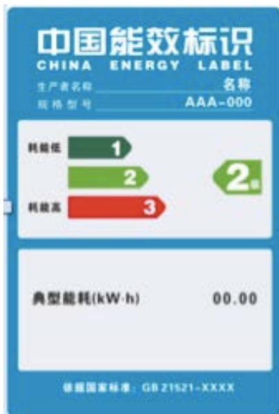
Old energy label